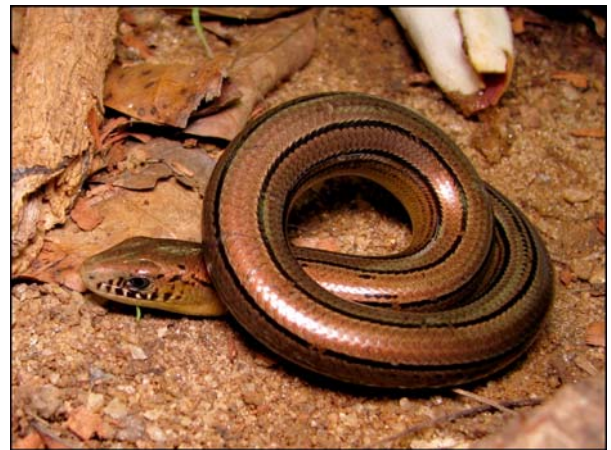
Figure 5. Ophiodes cf. striatus (MZUFV 763 in life).

2. Ophiodes cf. striatus (Spix, 1825) (Figure 5). N = 11. Ophiodes striatus (Spix, 1825) actually consists of a species complex. The taxon occurring in Viçosa may correspond to Ophiodes fragilis (Raddi, 1820), which is distributed in the