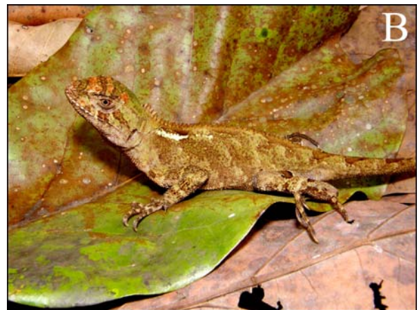
Figure 10. Enyalius brasiliensis . (A) Male (MZUFV 500 in life) Photo by H. C. Costa; (B) Female (MZUFV 701 in life). Photo by V. D. Fernandes.