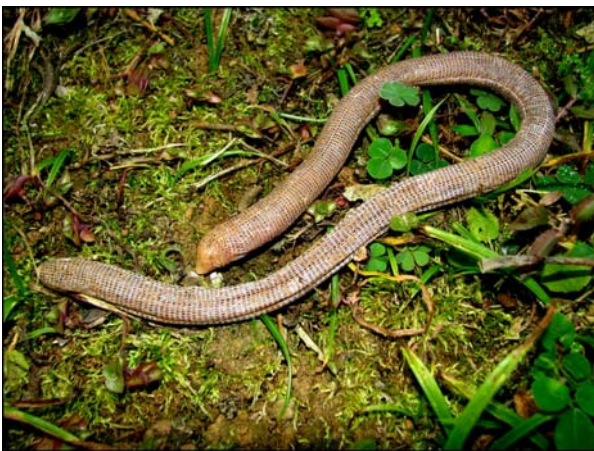
Figure 3. Leposternon microcephalum (MZUFV 707 in life).