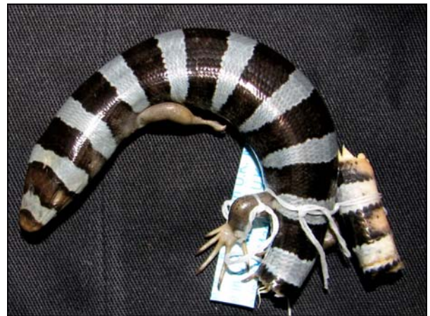
Figure 4. Diploglossus fasciatus (MZUFV 477; preserved specimen).

1. Diploglossus fasciatus (Gray, 1831) (Figure 4). N = 1. This species has disjunct distribution in Amazon and Atlantic Forest biomes, where inhabits forests and anthropic areas (Ávila-Pires 1995). The only specimen from Viçosa is a juvenile collected in urban area.