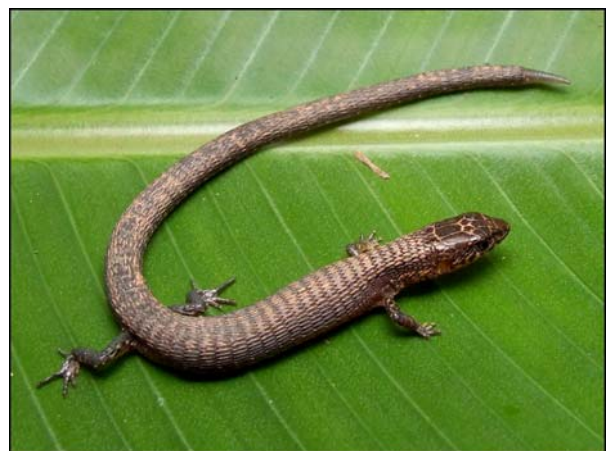
Figure 7. Eubleopis gaudichaudii (MZUFV 618 in life).

from Uzzell (1969), this small lizard occurs along the Atlantic Forest of southeastern and southern Brazil, with an additional record from state of Goiás (in central Brazil), without precise locality data (which also could be from an Atlantic Forest area, as the southern region of Goiás was originally covered by this biome [SOS Mata Atlântica and INPE 2008]). In Viçosa, E. gaudichaudii is found in secondary forest (1), old pastures in regeneration stage (9), urban area (2) and in UFV campus (2).