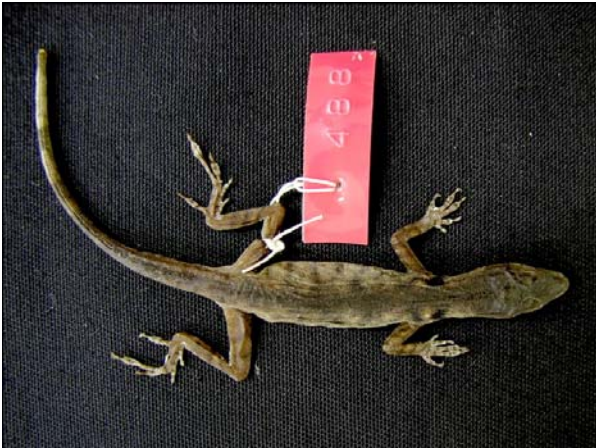
Figure 11. Anolis fuscoauratus (MZUFV 488; preserved specimen).

In Viçosa, there is one record from a forest fragment considered primary ( mata do Seu Nico ), and other from old pastures in regeneration stage.