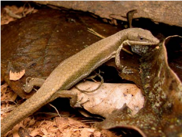
Figure 8. Placosoma sp. (MZUFV 725 in life).