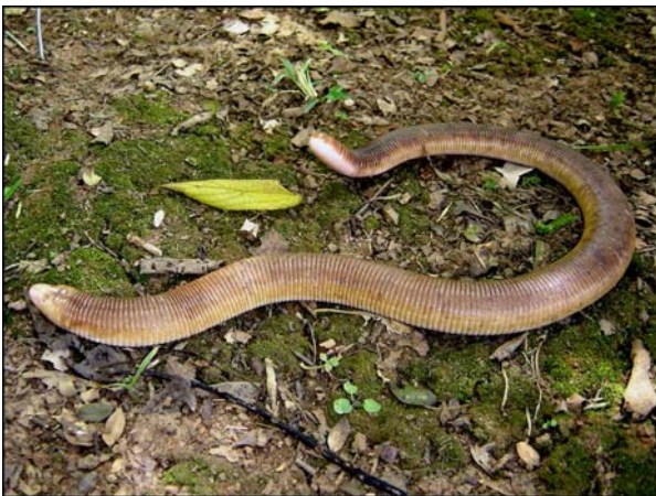
Figure 2. Amphisbaena alba (specimen not collected).

2. Leposternon microcephalum Wagler, 1824 (Figure 3). N = 7. Widely distributed in Brazil, also occurring in Bolivia, Paraguay, Argentina and Uruguay (Perez & Ribeiro 2008). In Viçosa, L. microcephalum is known to occur in UFV campus (1), urban (1) and rural (1) areas.