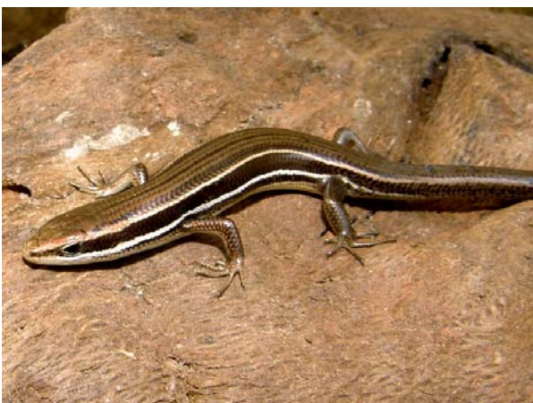
Figure 12. Mabuya dorsivittata (specimen not collected).

1. Mabuya dorsivittata Cope, 1862 (Figure 12). N = 12. With a wide distribution range, it inhabits fields with predominance of graminces in Uruguay, Paraguay, Argentina and Brazil (Peters and Donoso-Barros 1970; Recorder and Nogueira 2007). In Viçosa there are records from UFV campus (2) and old pastures in regeneration (6).