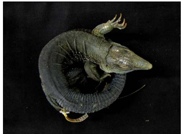
Figure 13. Ameiva ameiva (MZUFV 070; preserved specimen).

1. Ameiva ameiva (Linnaeus, 1758) (Figure 13). N = 1. It is an open area inhabitant (including clearings inside forests), well adapted to perianthropoc environments, occurring from Caribbean islands and Panama to southern Brazil (Ávila Pires 1995). Ameiva ameiva is the only species for which there is no information about the type of habitat it occupies in Viçosa. The presence of only one specimen housed in MZUFV (collected in 1973), and the fact that neither the authors nor other local researchers never saw an individual of this species in Viçosa can suggest that it has a marginal distribution in the study site, low density, or both. We also do not discard the hypothesis of a label error and that MZUFV 070 may not be from Viçosa.