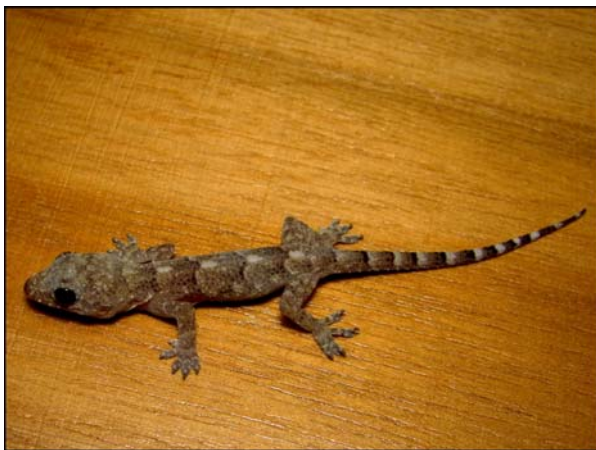
Figure 6. Hemidactylus mabouia (specimen not collected).

1. Hemidactylus mabouia (Moreau de Jonnés, 1818) (Figure 6). N = 20. Recent molecular studies confirmed that H. mabouia originated in Africa, but it is still inconclusive when and how it arrived in South America (by the means of natural rafting or inside slave ships during Brazilian colonization) (Carranza and Arnold 2006). Today, H. mabouia is distributed in West Africa and in the New World, from South America to Florida, being primarily found in urban areas, but also occurring in natural environments in some regions (Carranza and Arnold 2006; Rödder et al. 2008). In Viçosa there are some records of H. mabouia in urban areas (5) and in UFV campus (6), and it is expected that this species occurs throughout all municipality buildings. It is currently unknown to inhabit any regional natural areas.