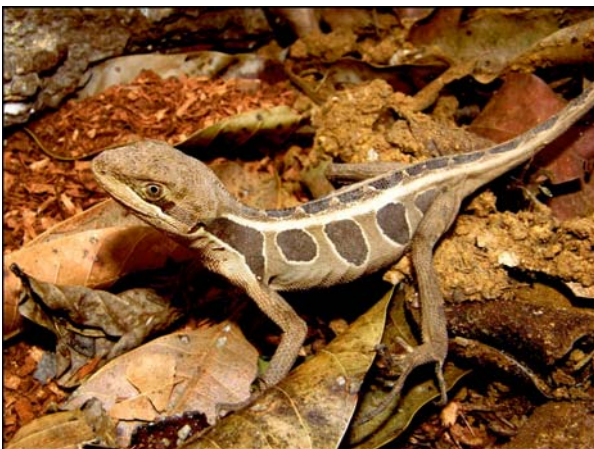
Figure 9. Enyalius bilineatus (MZUFV 730 in life).

1. Enyalius bilineatus Duméril & Bibron, 1837 (Figure 9). N = 16. This species is distributed in the Atlantic Forest biome of southeastern Brazil, and in Cerrado of central Brazil (but specimens from west of the Espinhaço Range may represent a distinct taxon [C. E. V Bertolotto, unpublished data]), this species occurs mainly in altered areas as coffee plantations and second-growth vegetation, occasionally entering the forest (Jackson 1978; Teixeira et al. 2005). In Viçosa it is known to inhabit old pastures in regeneration stage (7), secondary forests (2), UFV campus (2) and urban area (1).