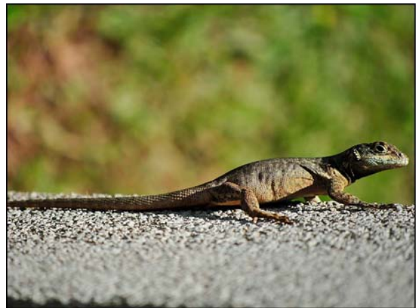
Figure 15. Tropidurus torquatus (specimen not collected).

municipalities near Viçosa have natural fragments of open fields (IEF 2007). Due to forest fragmentation along the 19th century and beginning of the 20th century (Ribon et al. 2003; Pereira 2005), it is possible that species inhabiting open formations (e. g. Mabuya dorsivittata and Tropidurus torquatus ) have dispersed from natural to anthropic fields, extending their distribution in the region. But we also do not discard the hypothesis that Viçosa had some patches of natural fields not reported in literature (where those species could naturally occur), altered by human action when the first settlers arrived.