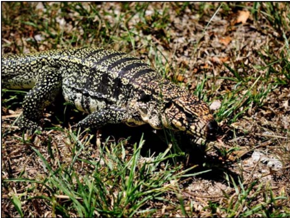
Figure 14. Tupinambis merianae (specimen not collected).

and small patches of forest. Voucher specimens with locality data are from inside secondary forest (1) and UFV campus (2).