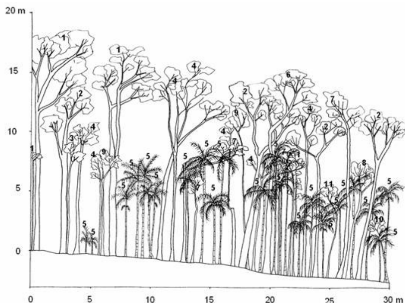
FIGURE 2. The arboreal components of a freshwater swamp forest fragment represented by a profile diagram. Horizontal distances from 0 to 30 m, down toward the water course. Vertical line corresponds to the plants height. 1. Calophyllum brasiliense ; 2. Handroanthus umbellatus ; 3. Unidentified species; 4. Protium spruceanum ; 5. Euterpe edulis ; 6. Tapirira guianensis ; 7. Dendropanax cuneatus ; 8. Magnolia ovata ; 9. Guarea kunthiana ; 10. Myrceugenia ovata ; 11. Eugenia sp..