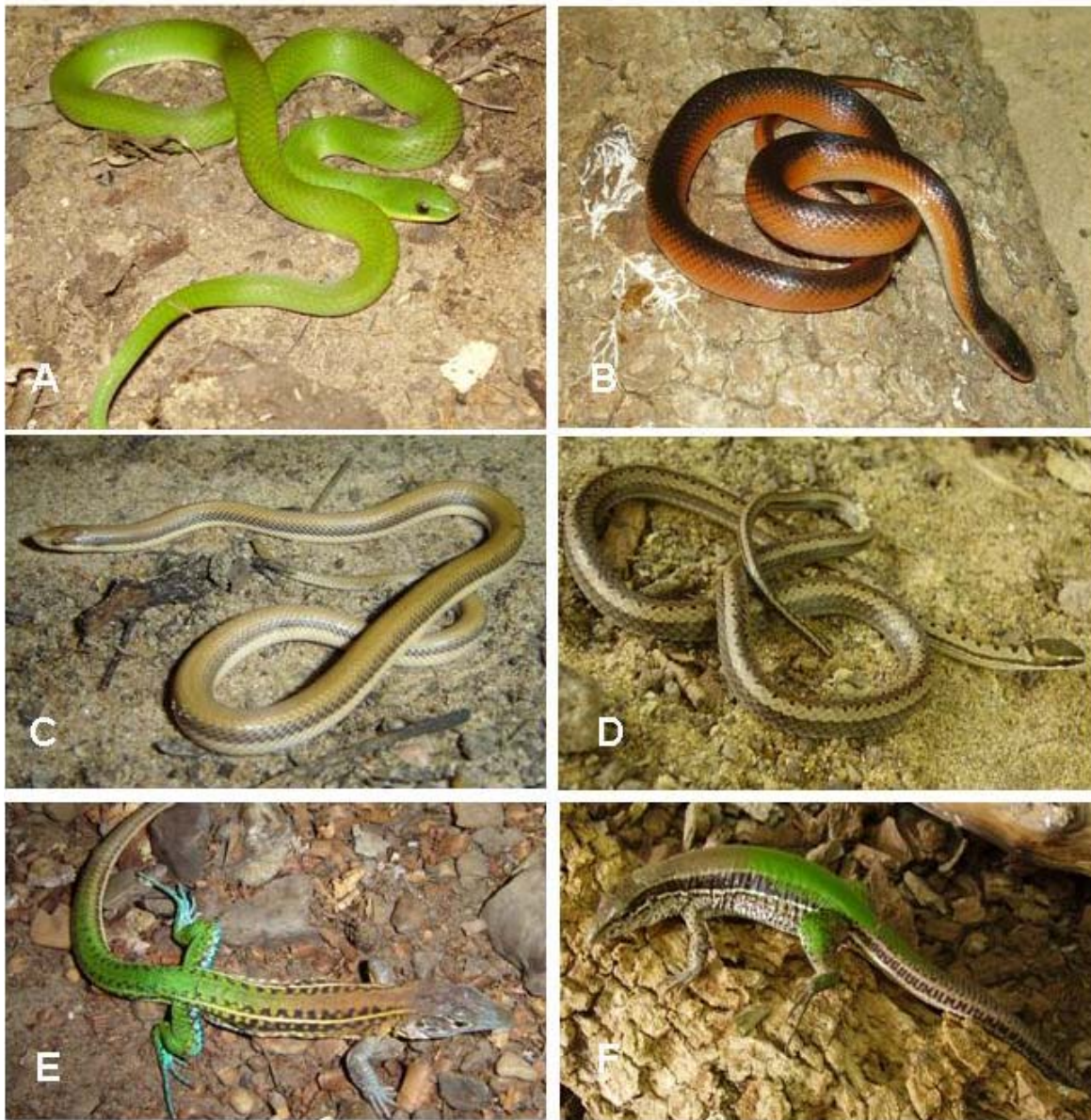
Figure 3. Representatives of some of the reptiles recorded at the Oriental Chaco: A) Liophis guentheri (photo by C. C. Calamante); B) Clelia bicolor (photo by C. C. Calamante); C) Phimophis vittatus (photo by V. H. Zaracho); D) Echinanthera occipitalis (photo by C. C. Calamante); E) Teius teyou (photo by V. H. Zaracho); F) Ameiva ameiva (photo by C. C. Calamante).