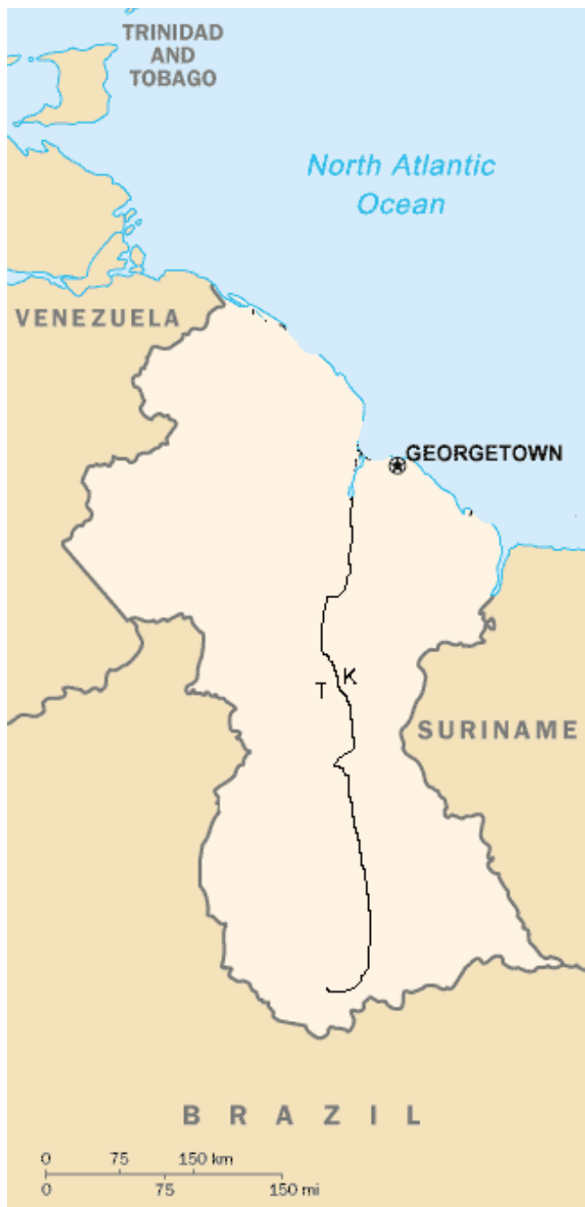
FIGURE 1. Location of study areas, Kurupukari (K) and Three Mile Camp (T), on the Essequibo River, central Guyana.

In 1990, some habitat disturbance had occurred in the area and by 1997, human presence had increased. In the years since these collections were made, ferry service and road traffic have increased further, resulting in additional disturbance on both sides of the river. We recommend additional study in the area to determine the effects of human disturbance on the herpetofauna. This study should serve as a baseline for comparison with future faunal studies.