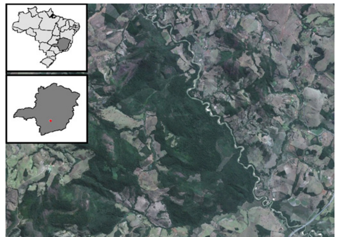
FIGURE 1. Location of the Estação Ecológica Mata do Cedro in Minas Gerais state (upper left, red dot) and a satellite image of the EEMC.

Like other studies (e. g. Eduardo and Passamani 2009), we adopted the definition of mammal size patterns described by Emmons and Feer (1997), who considered medium-sized mammals as those weighting 2 to 7 kg, and large-sized mammals those weighting more than 7 kg.