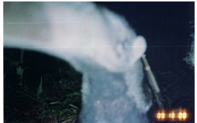
FIGURE 2. Giant Anteater ( M. tridactyla ) registered in the camera-trap.

Hunting, invasion of domestic animals (cattle, dogs) and illegal logging were confirmed during the survey in most of the reserve, indicating high degree of human activities near and inside the area. On the other hand, the considerable diversity of medium and large-sized native mammals, and the presence of vulnerable species such as the Puma and Giant Anteater emphasizes the ecological quality and conservational importance of this reserve. In addition, more studies are required to estimate population parameters of these susceptible species in order to assess the importance of this area for a long-term conservation.