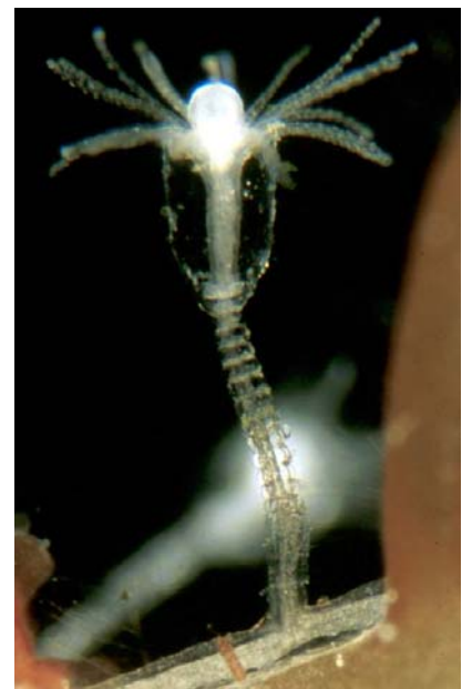
Figure 3. Clytia gracilis ; on Hypnea musciformis from São Sebastião, Brazil.