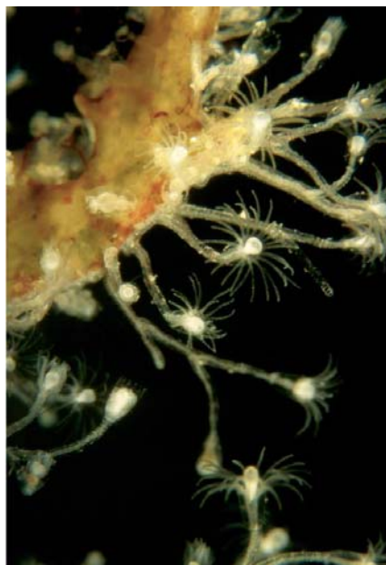
Figure 2. Clytia gracilis ; on Sargassum furcatum from São Sebastião, Brazil.