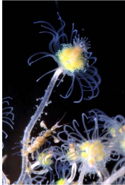
Figure 5. Ectopleura obypa ; from São Sebastião, Brazil.