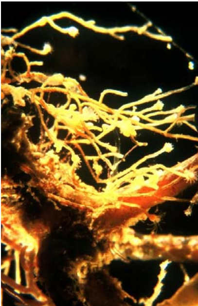
Figure 7. Eudendrium pocaruquarum from São Sebastião, Brazil.