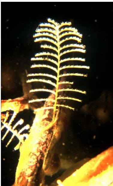
Figure 1. Aglaophenia latecarinata ; on Sargassum furcatum from São Sebastião, Brazil.

Zanclaea sp. ( sensu Fauci & Boero, 2000) – Cystoseira compressa (Esper) Gerloff & Nizamuddin, Cystoseira barbata (Stackhouse) C. Agardh, and Cystoseira amentacea (C. Agardh) Bory de Saint-Vincent from Porto Cesareo, Italy (Fauci and Boero 2000).