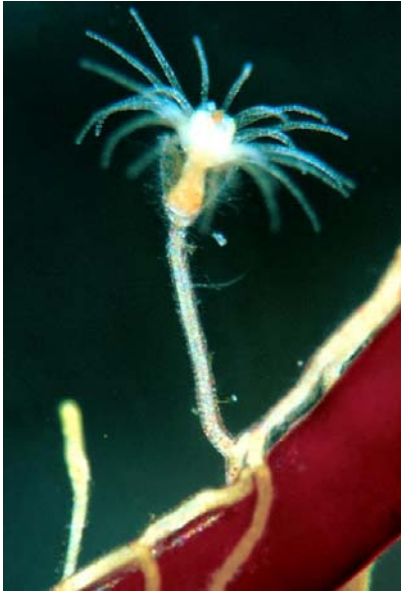
Figure 4. Clytia noliformis ; on Galaxaura frutescens from São Sebastião, Brazil.