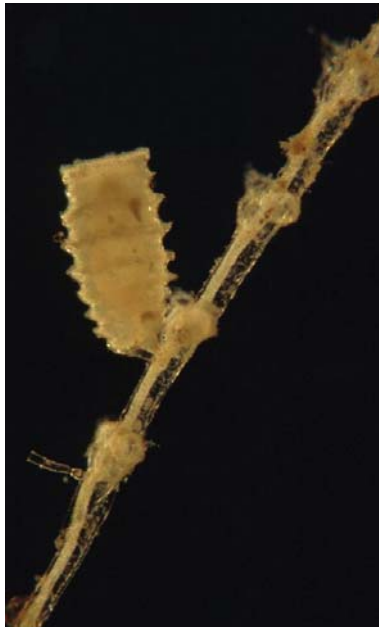
Figure 8. Sertularia loculosa ; from São Sebastião, Brazil.