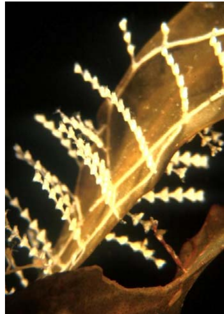
Figure 9. Sertularia turbinata ; on Sargassum cymosum from São Sebastião, Brazil.