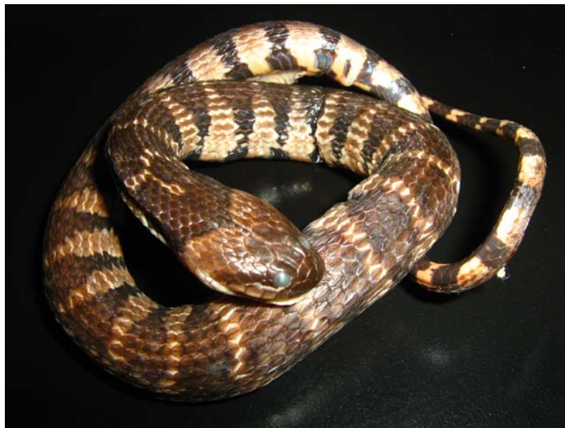
Figure 2. Specimen of Helicops angulatus (LZ-URCA 492) collected at Chapada do Araripe, CE