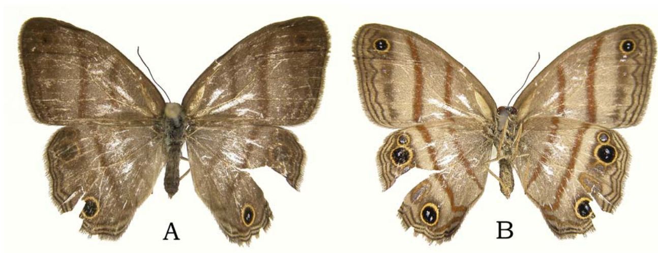
Figure 1. Female C. terrestris collected during the study (forewing length 16,48 mm). a) Dorsal; b) Ventral

The individual was collected on February 5 of 2005 in a canopy trap and was determined by using DeVries (1987). It is housed in the National Institute of Biodiversity (INBio) collection