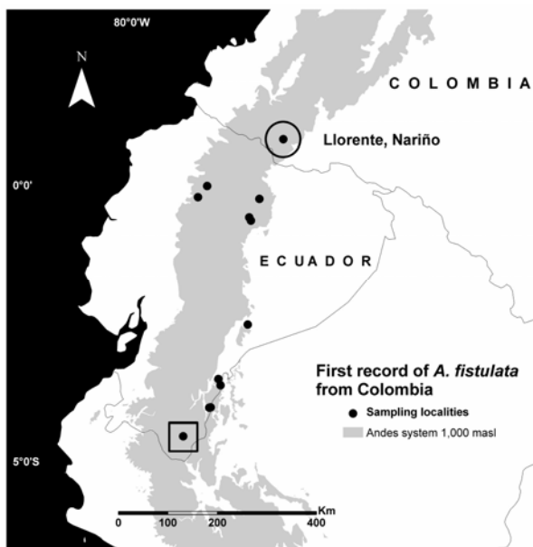
Figure 1. Distribution extension of A. fistulata . Black dots represent A. fistulata type locality (square) in Ecuador and first confirmed record in Colombia (circle) (FMNH 113512). Sampling localities of A. fistulata from Ecuador were obtained from Muchhala et al. (2005).

Nectar feeding bats of the genus Anoura are a common component of the highlands of the Neotropics. Distribution of Anoura species are thought to be primarily influenced by the geologic complexity of the northern portion of South America and particularly by the uplifting of the Andean System (Mantilla-Meluk and Baker 2006). Eight species of Anoura are presently recognized including: A. aequatoris , A. cadenai , A. caudifer , A. cultrata , A. fistulata , A. geoffroyi , A. latidens , and A. luismanueli . All species of Anoura are thought to be present in Colombia where the Andean System reaches its maximum geologic complexity (van der Hammen 1974).