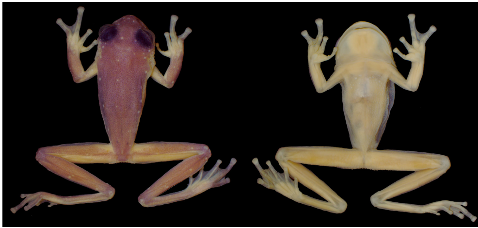
FIGURE 1. Teratohyla midas (MNRJ 23856). SVL 19.5 mm.