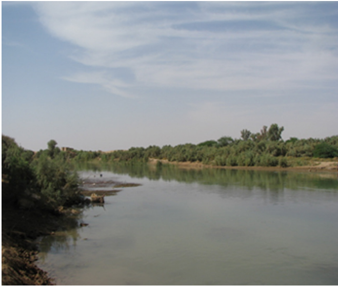
FIGURE 2. Collection site at southern branch of the Karkheh River, Khuzestan Province, Iran.