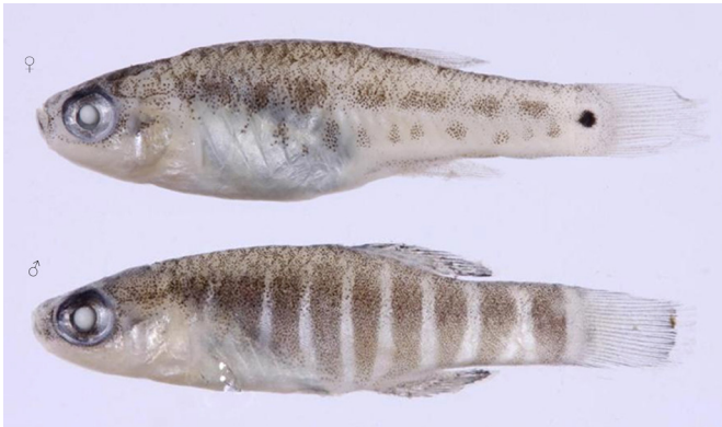
FIGURE 3. A pair of A. mesopotamicus individuals captured in a branch of the Karkheh River near Hoor-Al-Azim Wetland (IUT13890807-236-15).