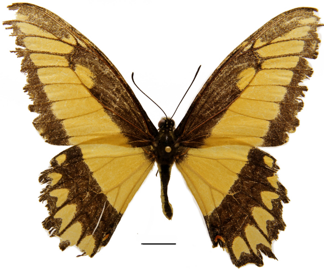
FIGURE 2. Heraclides a. astyalus , male specimen collected in the Catimbau National Park, Buíque, Pernambuco. Scale bar = 1cm.

ACKNOWLEDGMENTS: We are grateful to Artur Maia and André V. L. Freitas for suggestions on this article.