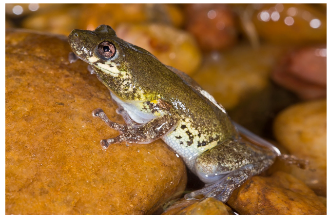
FIGURE 1. Adult male of Scinax camposseabrai from Curaçá, Bahia (C02270).

Despite the putative rarity of Scinax camposseabrai , these records indicate that the species can potentially be found in several habitat types as Seasonal Forests, Gallery Forests, Arboreal Caatinga, and open cerrado-like habitats at "planalto sul-baiano" (Maracás), Espinhaço mountain range (Matias Cardoso and Igarorã), and the São Francisco dry plains. At these areas the specimens were observed on temporary ponds formed by strong rains. The species is more often observed on soil or close to soil, perched on low scrubs and grasses. Bokermann (1968) reported