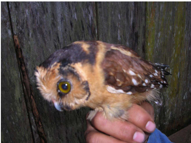
FIGURE 3. Aegolius harrisi , at Abra Patricia, Amazonas department.

Previous records of Aegolius h. harrisi in Peru were restricted to seven localities, five of which were in the departments of Tumbes and Piura, northern Peru. As a result, Schulenberg et al. (2010) considered the species local and rare. In this article we present thirteen records for the species not included in the map in Schulenberg et al. (2010). Based on this new information, Aegolius h. harrisi appears to have a more extensive distribution on both sides of the Andes. Of the new records presented here, four include the western slope of the Andes in the departments of Piura, Lambayeque and Cajamarca. Two new records are located on the east slope in northern Cajamarca, three records are restricted to the southern portion of the Amazonas department, and the remaining four are single reports from each of the following departments: Junin/Pasco, Ayacucho, Cuzco and Puno. These last three records significantly increase the species' distribution in Peru. Additionally, the elevation range for Aegolius h. harrisi in Peru is from 250 m (El Tocto) to 2960 m (Cerro Chinguela). The lowest elevation was of an individual encountered in May 1987 (as described above), after strong El Niño southern oscillation rains in northwest Peru (Marcharé and Ortlieb 1993). The subsequent change in vegetation structure and composition may have influenced the species' use of lower elevations in the area.