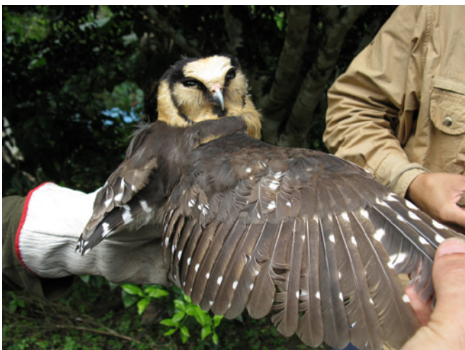
FIGURE 4. Aegolius harrisi , at Santa Rosa de Kuviriari, Cuzco.