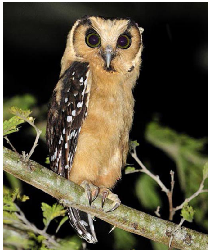
FIGURE 1. Aegolius harrisii at San Antonio Private Conservation Area, Amazonas department (Photo by Michell León).

We obtained information of six unpublished records from scientific collections, one unpublished recording of the species from Xeno-Canto ( http://www.xeno-canto.org ).