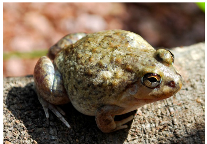
FIGURE 1. Pleurodema diplolister (ZUFG 5910) collected in São Domingos municipality, state of Goiás, Central Brazil.

this species in the state of Goiás (Figure 2, Table 1) and extends known distribution ca. 82 km southeast from the nearest previously recorded locality (Arraias municipality, state of Tocantins; Maciel and Nunes 2010). In addition, it represents an important biogeographical record for the known distribution of P. diplolister , as it is inserted in the relictual area of distribution of Seasonally Dry Tropical Forests (SDTF) in central Brazil. The occurrence of P. diplolister in São Domingos may represent evidence of historical connections between Caatinga and the SDTF enclaves within the Cerrado. Biogeographic patterns have suggested that during the lifetime of the Pleistocenic Arc (~21kyr BP; Last Glacial Maximum), some components of the nucleus of Caatinga may have colonized the Cerrado region, where they currently maintain viable populations at the disjunct SDTF enclaves, with great importance for biodiversity conservation (Silva and Bates 2002; Werneck and Colli 2006).