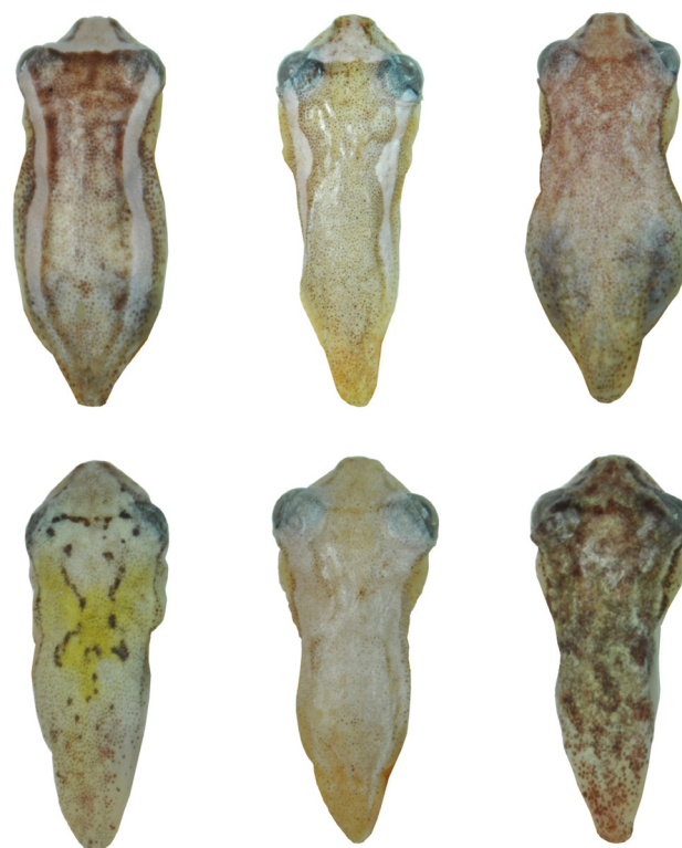
FIGURE 3. Dorsal color pattern variation found in individuals of Dendropsophus haddadi from Serra da Saudinha and Mata do Catolé, Maceió, Alagoas state, Brazil (from left to right MUFAL 5514, 3313, 5513, 9076, 3424 and 9778).