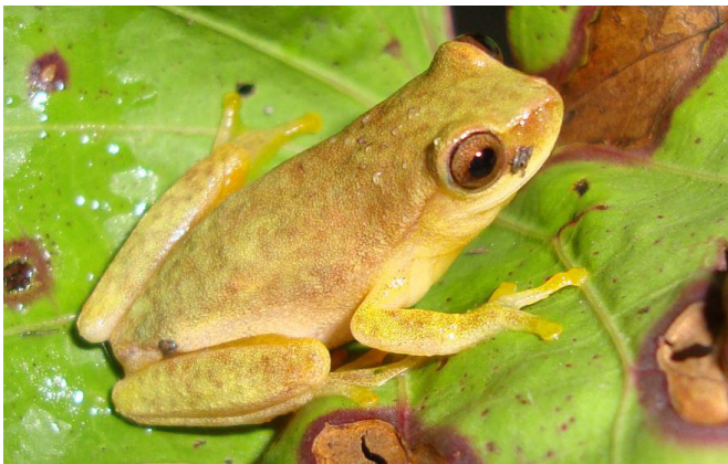
FIGURE 1. Adult male of Dendropsophus rubicundulus from the municipality of Granja, Ceará state, Brazil.

During field work in May, 2010 in the municipality of Granja, state of Ceará (03°07'22" S, 40°50'03" W), individuals of D. rubicundulus were found calling under the marginal vegetation of ponds (Figure 1). The locality presents transitional vegetation between the Cerrado and Caatinga Domains with artificial permanent ponds and temporary ponds during the rainy season that extends from