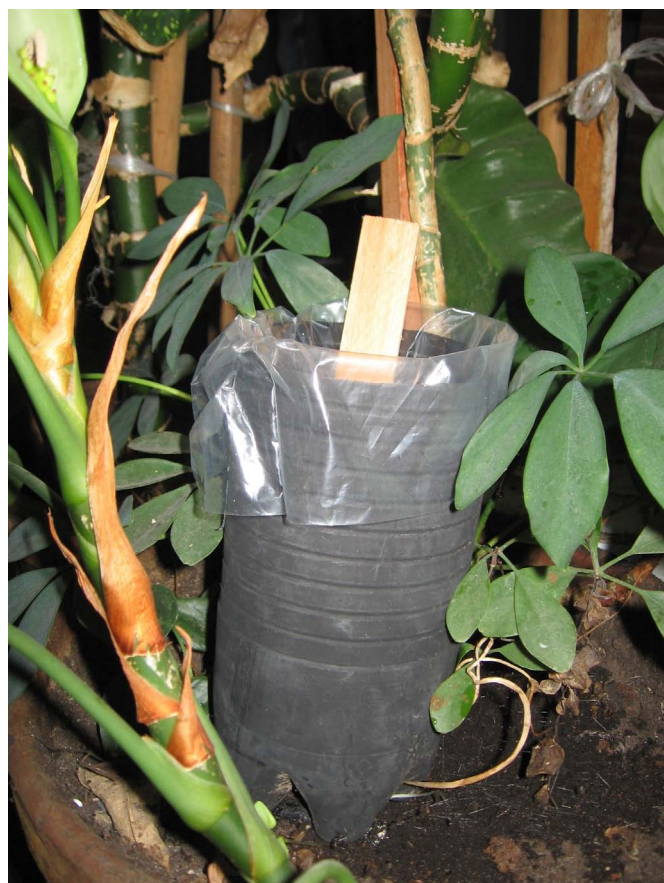
FIGURE 2. Ovitrap with paddle.

The Ceratopogonidae identified species was D.