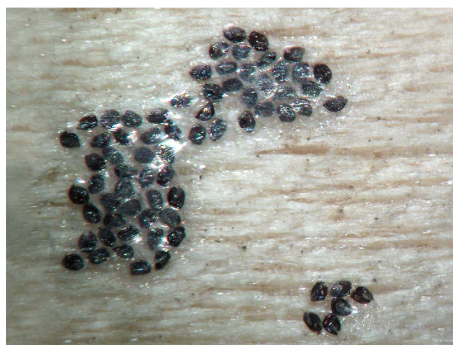
FIGURE 3. Egg mass of Dasyhelea necrophila .

The number of eggs groups per paddle varied as follows: 30.8% of paddles had only one egg group; 23.2 % of paddles had 2 groups; 19.3 % had 3 groups; 7.7 % had 6 groups and 3.8 % had 5, 9, 10, 11 or 22 groups. The eggs were deposited at 5.4 cm minimum average high (1-12.4) and 6 cm maximum average high (1-12.4) from the lower tip. Height of oviposition above the waterline was not recorded, but the records allow us to suppose that the water level was very variable in the ovitraps in the different trap localities. These observations allow us to broaden awareness of the egg masses of D. necrophila in nature and geographical distribution of this species.