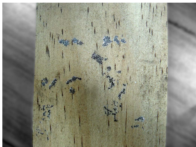
FIGURE 4. Egg mass of Dasyhelea necrophila in a paddle.

The knowledge of the breeding sites of different Diptera in the same habitat is very important to application of methods for biological integrative control, especially species with economical and sanitary relevance which share the same habitat for ontogenetic development.