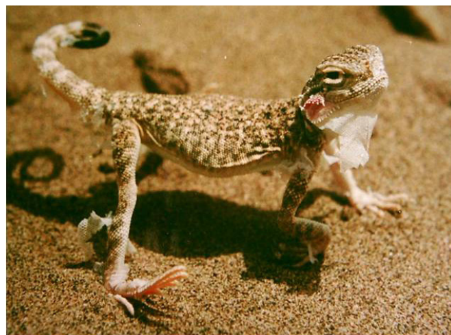
FIGURE 3. Phrynocephalus mystaceus in natural sandy habitat.

In all specimens studied, there is a greatly enlarged scale (equal to about four adjacent scale) on each side of thorax behind maxilla and occasionally an additional scale or two slightly smaller adjacent to it. This property