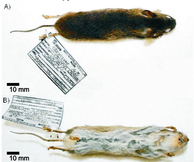
FIGURE 1. Adult female of Calomys laucha sampled in Faxinalzinho municipality, state of Rio Grande do Sul, southern Brazil. Dorsal (A) and ventral (B) views of a stuffed skin (Specimen: N o Zoo 300).

was sampled on 5 May 2010, in a shrubby area associated with forest borders in the city of Faxinalzinho. The specimen has a body length of 90 mm, tail length of 66 mm, ear length of 10 mm, foot length with nails of 16 mm, foot length without nails of 14 mm and weights 16 g. The individual was captured during a field study developed with the rodent community of that region, which consisted of three sampling periods between September 2009 and May 2010. In each trapping period, traps were placed randomly on the ground and the total trapping effort amounted to 2400 trap-nights (800 trap-nights per sampling). Standard Tomahawk® traps of one size (12cm x 12cm x 25cm) were used. Other rodents were concomitantly captured: Akodon montensis (36 specimens), Oligoryzomys flavescens (11), Oligoryzomys nigripes (4), Mus musculus (4) and Akodon reigi (2). The collection was held under the IBAMA (Brazilian Institute for the Environment and for Renewable Natural Resources) permit number: 15224-2.