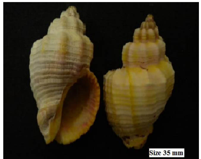
FIGURE 1. Cantharus tranquebaricus from Pondicherry mangroves, India (PUUGCMP-01).

Feeding: They feed on small crustaceans and marine worms.