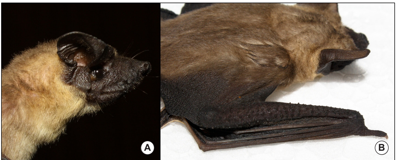
FIGURE 4. Specimen of Neoplatymops mattogrossensis (MN 75213) collected in Serra da Jitirana, Piauí State, Northeastern Brazil, with emphasis for flattened rostrum (A) and granulation in the forearm (B).