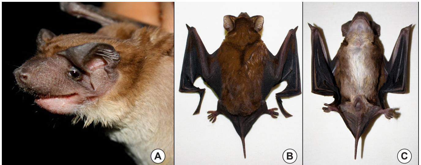
FIGURE 2. Specimen of Cynomops planirostris (MN 75209) collected in Serra da Jitirana, Piauí State, northeastern Brazil, with a facial close-up (A) and views of the dorsal (B) and ventral (C) pelage.

5.11 g (Figure 2). It was captured in a ground-level mist net at the margin of an artificial pond in the edge of a shrubby Caatinga fragment of Serra da Jitirana, municipality of São João do Piauí (8°18'28.66" S and 42°1'19.62" W, altitude ca. 370 m). This individual was collected and deposited under the number MN 75209. The identification was performed according to the characters proposed by Gregorin and Taddei (2002) and Fabián and Gregorin (2007). Cynomops planirostris is distinguished from its most similar congener, C. paranus , by its smaller size, including forearm and tail length, and distinct fur coloration. Cynomops planirostris has reddish brown, opaque dorsal pelage, and lighter ventral pelage, with a white spot on his chest and belly (Figure 2) (Simmons and Voss 1998). C. paranus , on the other hand, shows a homogeneous dark gray-brown, bright pelage (Simmons and Voss 1998; Fabián and Gregorin 2007). In addition to the present record, C. planirostris has been recorded in 10 other sites in nine Brazilian states (Table 1; Figure 3).