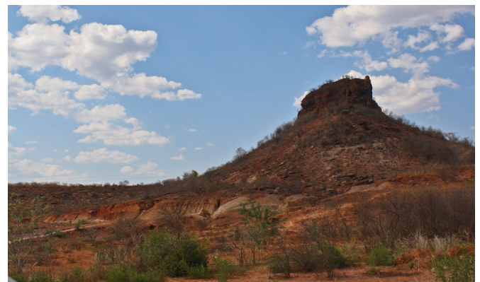
FIGURE 1. Landscape of shrub Caatinga in Serra da Jitirana, municipality of São João do Piauí, Piauí State, Northeastern Brazil.

The records we present here were made while monitoring the bats around the São João do Piauí - Milagres section of the 500kV transmission energy line. Between June 2010 and March 2012, we conducted surveys of bats in the municipality of São João do Piauí, Piauí, Northeastern Brazil. The individuals were taken in areas of Caatinga where xerophytic and heliophytic vegetation is dominant (Figure 1). In some areas there are seasonal artificial dams, which reach their maximum total volume during the rainy season and dry completely or partially during the driest