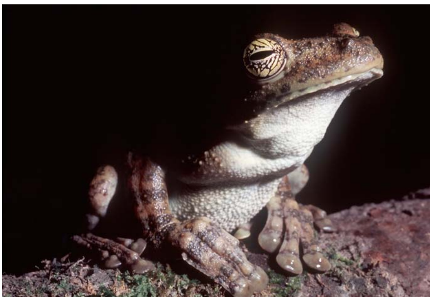
Figure 1. A male specimen of Itapotihyla langsdorffii . Photo by Miguel Andrade.

after verifying the geographical coordinates for the older records where I. langsdorffii was found, the coordinates of municipality of Rio Novo actually pertain to municipality of Goianá, state of Minas Gerais (IBGE 2003). Itapotihyla langsdorffii was considered vulnerable in the Red List of Endangered Species of the state of Minas Gerais (Machado et al. 1998). In the revision for this list (Machado et al. 2005), it was not considered threatened, but there is still few information about its occurrence in the state. Herein we report a new distribution record for I. langsdorffii in Minas Gerais (Figure 2).