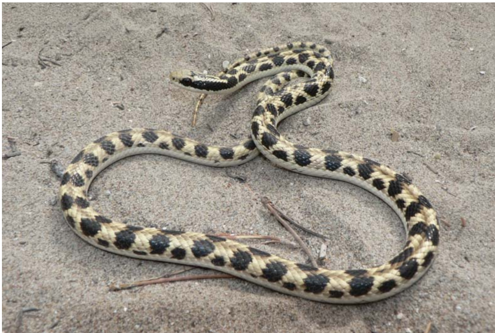
Figure 2: Liophis sagittifer sagittifer from 40 km west of Uzcudun post, near rio Chico , department of Florentino Ameghino, province of Chubut, central Patagonia, Argentina.

steppe ecotonal area. Distance from peninsula de Valdes is more than 200 km airline, representing the southernmost vouchered record for this species and extending its distribution to central-east province of Chubut. The voucher was deposited in the herpetological collection of the Museo Argentino de Ciencias Naturales Bernardino Rivadavia , Ciudad Autonoma de Buenos Aires, Argentina, under number MACN 39041.