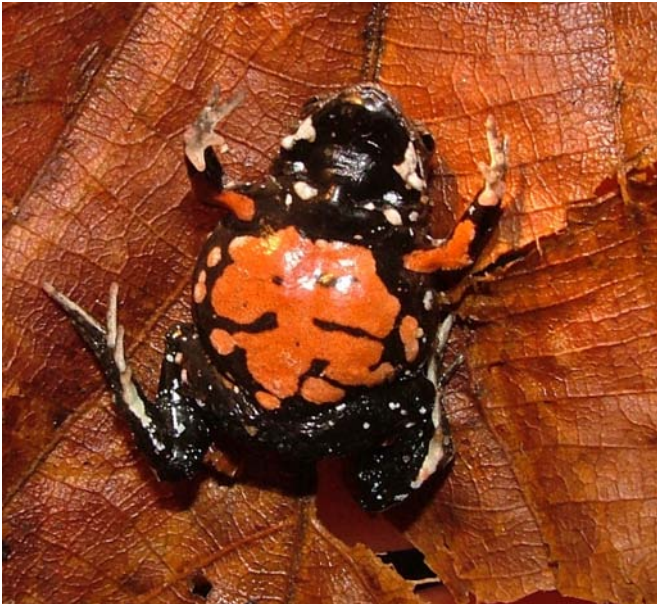
FIGURE 2. Ventral view of MNRJ 51501 in life.