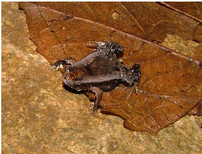
FIGURE 1. Dorsal view of live adult female Paratelmatobius mantiqueira (MNRJ 51501) from the municipality of Resende, state of Rio de Janeiro, Brazil.

On 14 November 2005 at 20:45 h a female Paratelmatobius mantiqueira (snout-vent length = 22 mm)