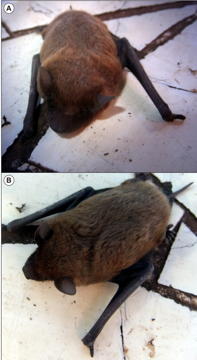
FIGURE 2. Frontal (a) and dorsal (b) view of the specimen of Molossops neglectus from Santo Tomé, Corrientes, Argentina.

and 1 km South Arroyo Itacúa. The area corresponds to the Fields and Weedlands ecoregion in the sense of Burkart et al. (1999), which adds a new ecoregion for the distribution of the species, since the locality of Misiones is in the Paranean Forest. The region around Santo Tomé is strongly anthropized by the presence of rice fields, cultivations of yerba mate, and forestry.