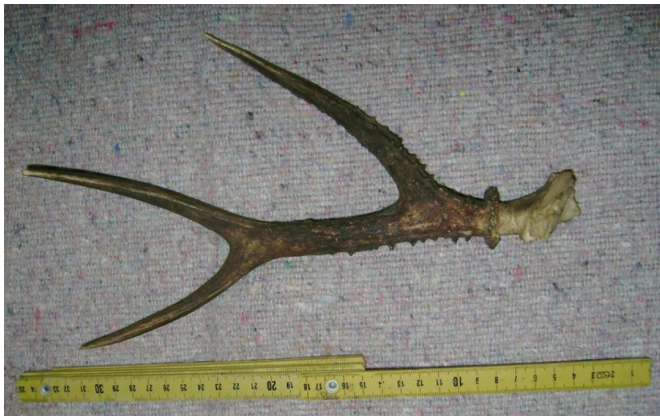
FIGURE 2. Horn of Ozotoceros bezoarticus hunted around the year 1975 in Fazenda Campo Grande, located in the municipalities of Itaipópolis and Rio Negrinho, Santa Catarina, southern Brazil.