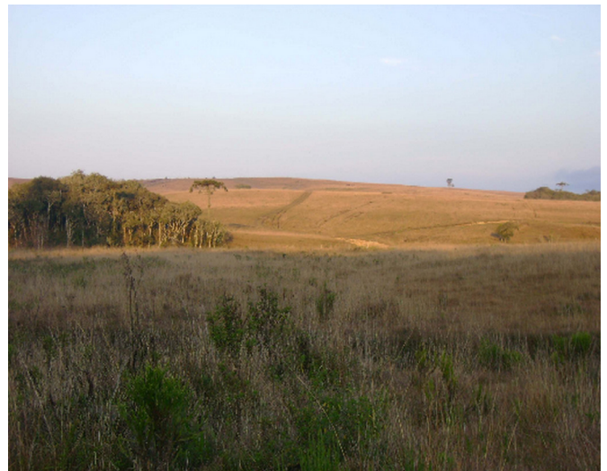
FIGURE 1. Remaining area of native grassland at Fazenda Campo Grande, located in the municipalities of Itaiópolis and Rio Negrinho, Santa Catarina, southern Brazil.

The records were obtained through observation of biological material and interviews with officers and hunters, all local residents that have lived in the region for over 30 years.