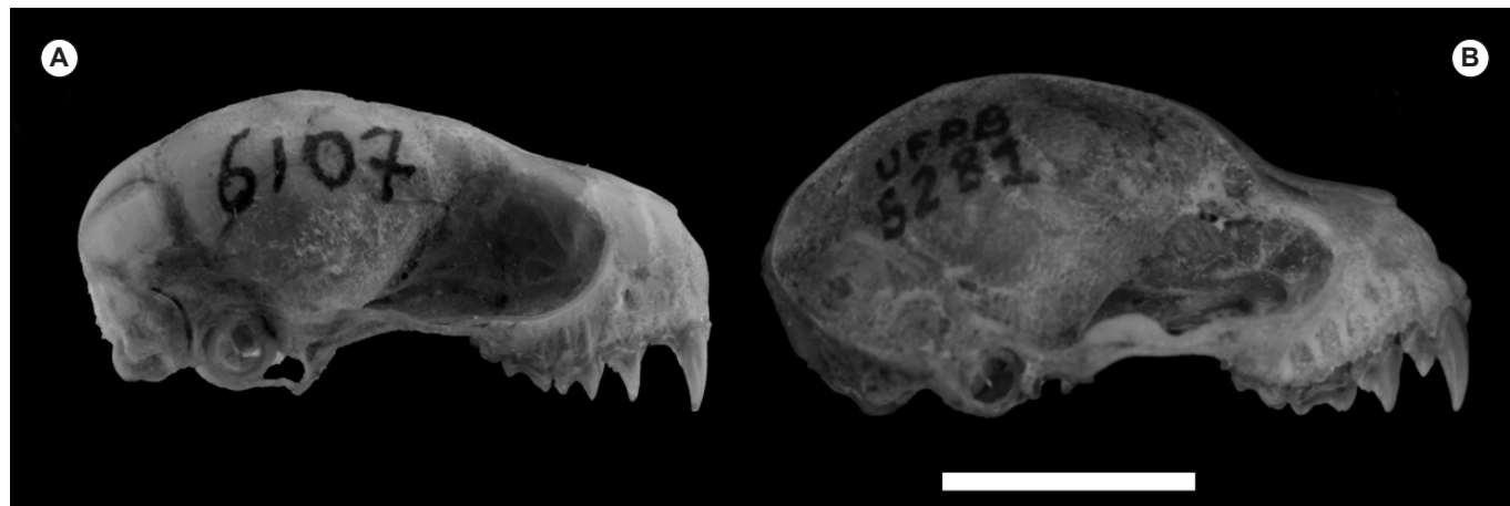
FIGURE 2. Lateral view of the skull of (A) Uroderma magnirostrum (UFPB 6107) and (B) Uroderma bilobatum (UFPB 5281). Scale bar = 10 mm.

yellowish edging (Davis 1968). All the external and cranial characters of the two U. magnirostrum specimens collected in the present study are in accordance with characters described by previous authors (Davis, 1968; Nogueira et al. 2003). Additionally, cranial measurements taken from the specimens from Sergipe fall within the range recorded for specimens collected in southeastern Brazil (Table 1).