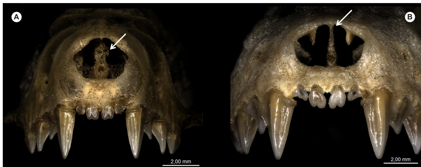
FIGURE 3. Frontal view of the skull of (A) Uroderma magnirostrum (specimen UFPB 6107) and (B) Uroderma bilobatum (specimen UFPB 5281). The mesethmoid bone is indicated by the white arrow.