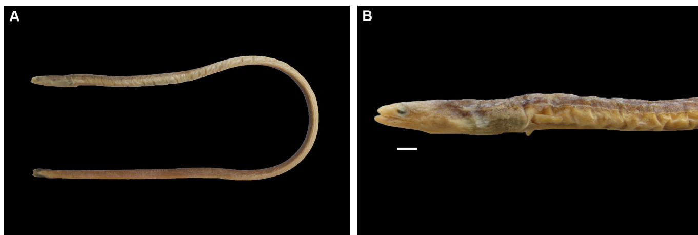
Figure 1. Moringua edwardsi (CIDRO 67, 301.0 mm TL) collected in Atol das Rocas, northeastern Brazil. The entire animal (A) and a close-up of the head (B). Scale: 3.0 mm.

Description: Pectoral fin rays 10; lateral-line pores to anus 74; total vertebrae 110; predorsal vertebrae 84; preanal vertebrae 84. Measurements in percent of TL: head length (HL) 7.3, preanal length 68.3, and body depth 1.7. Measurements in percent of HL: eye diameter 4.0, snout length 15.0, upper jaw length 20.9, and pectoral fin length 19.5. Lower jaw projects beyond upper jaw; dorsal fin is inserted behind level of anus; lateral line complete. Mature specimen. Coloration: dark brown on dorsal region and caudal fin, pale white ventrally; dorsal, anal and pectoral fins yellowish (Figure 1).