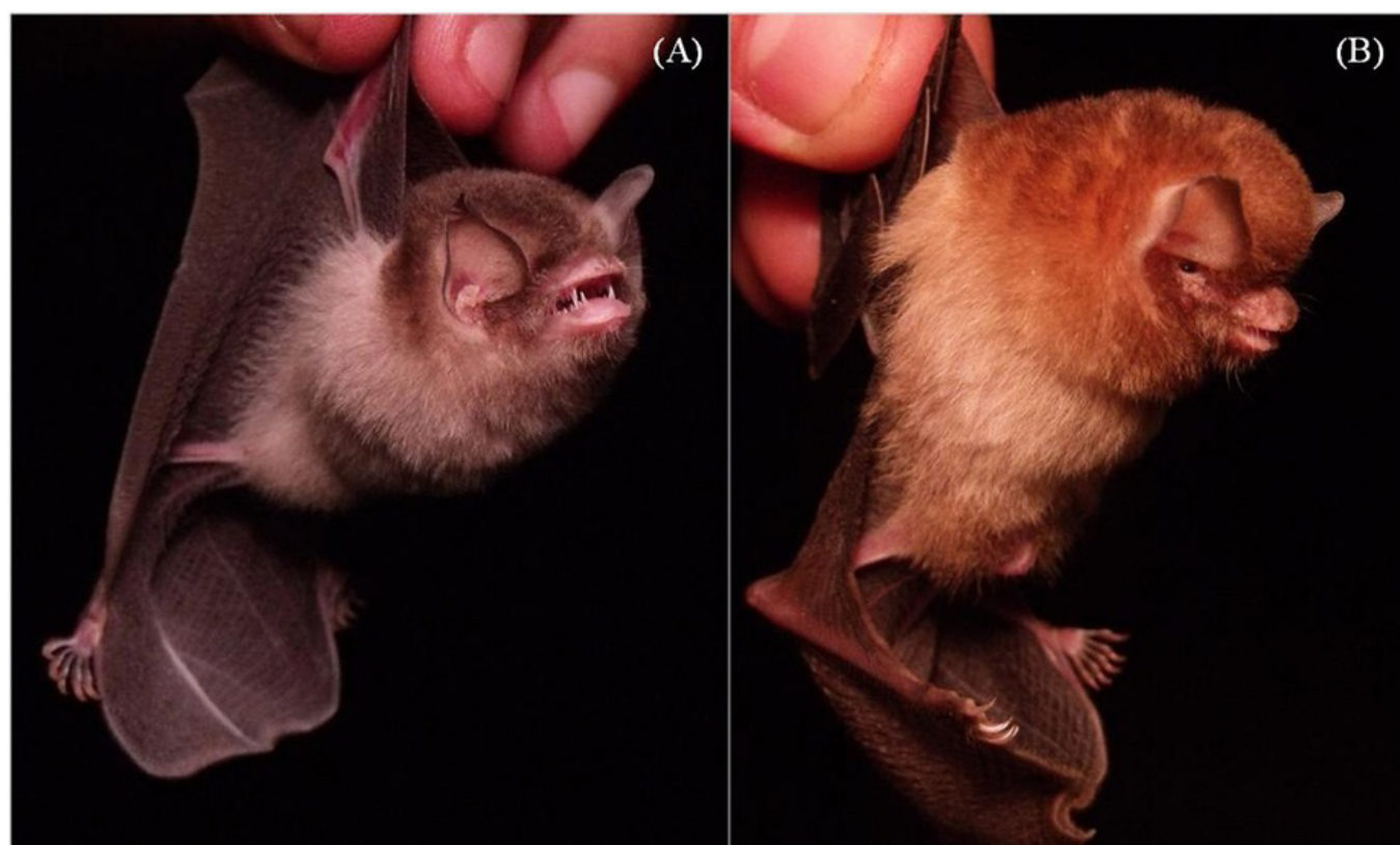
FIGURE 2. (A) juvenile and (B) adult Natalus macrourus from Caverna da Fumaça.

ACKNOWLEDGMENTS: We are grateful to CAPES (PAR, JAF) for graduate fellowship and CNPq for a research grant to SFF (process no. 303994/2011-8).