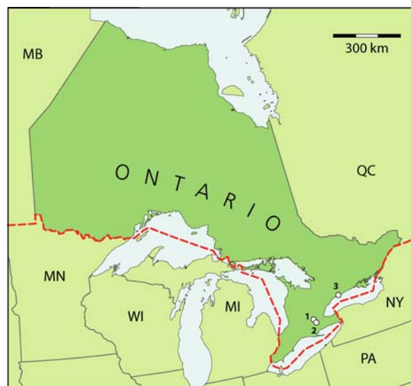
Figure 1. The province of Ontario, showing the two localities mentioned in the text, Grand River (1 and 2) and Bowmanville Creek (3).

The samples often contain large numbers of shells that were sorted out by hand. Of the eight samples that we have sorted, three contained shells of Carychium minimum and Cecilioides acicula and are reported here (Table 1, Figure 1). The Grand River and Bowmanville Creek drainages include extensive farmland and urban areas with small patches of woods. All specimens have been retained in the personal collection of RGF.