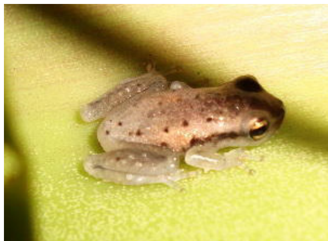
FIGURE 1. Phyllodytes punctatus (C224), Parque Nacional Serra de Itabaiana, state of Sergipe, Brazil.

Phyllodytes punctatus (Figure 1) belongs to the Phyllodytes tuberculatus group (Faivovich et al. 2005), and is characterized as a small species of pale brown color with distinctive brown dots of varying number and distribution along the dorsal surface. Until now, the distribution of this species was restricted to its type locality, at Fazenda Gravatá (10°47' S, 36°54' W), municipality of Santo Amaro das Brotas, state of Sergipe, northeastern Brazil (Caramaschi and Peixoto 2004).