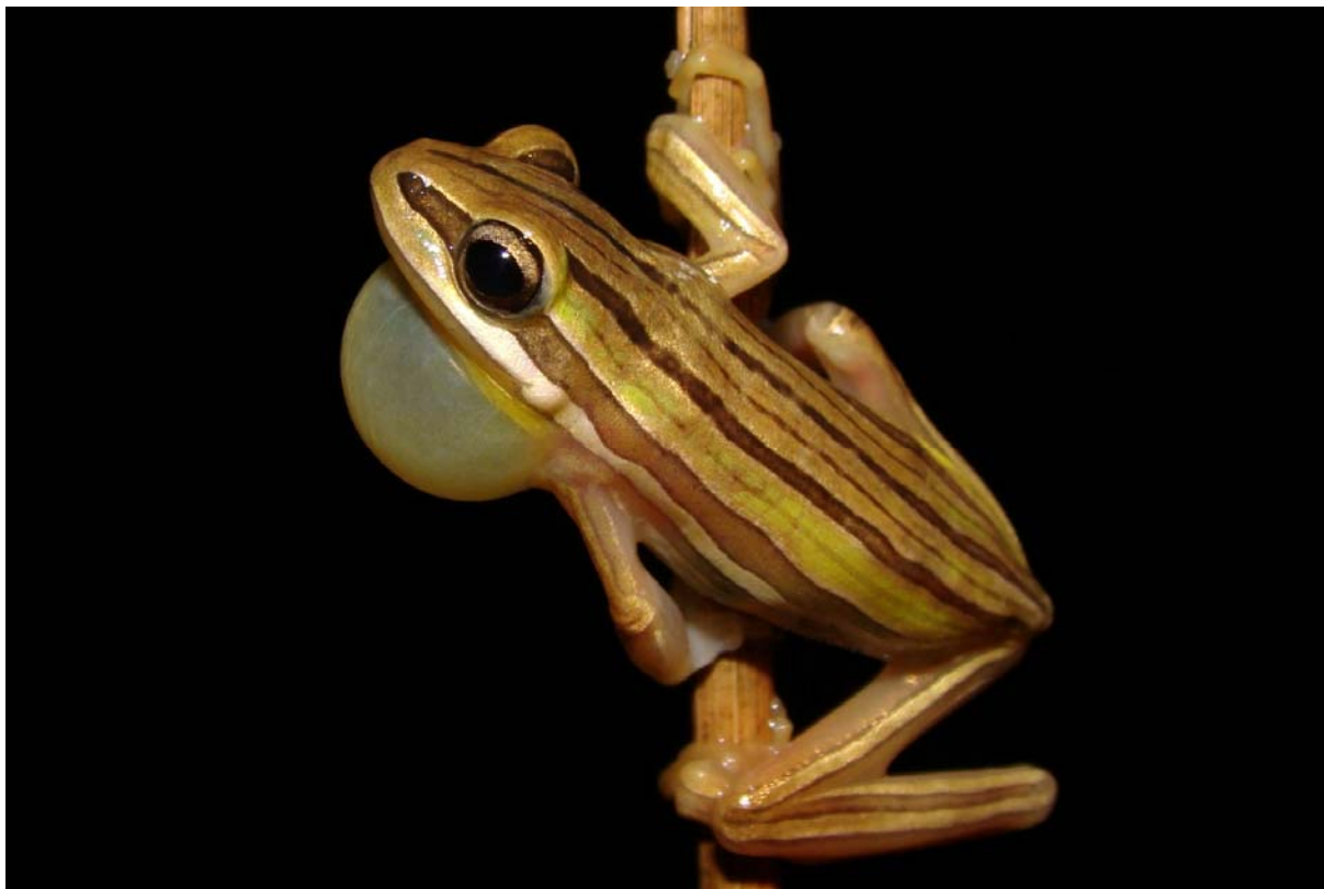
Figure 2. Adult male of Hypsiboas stenocephalus from Parque Estadual da Serra do Papagaio, Minas Gerais, Brazil.