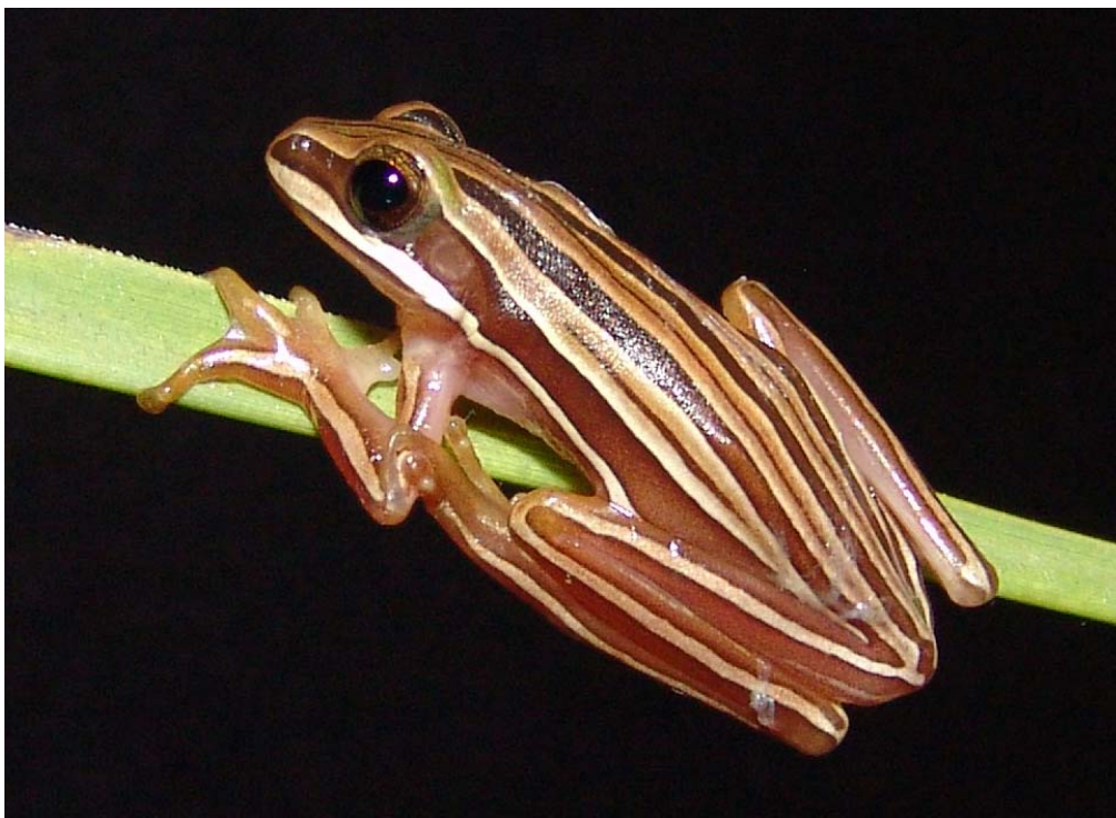
Figure 1. Adult male of Hypsiboas stenocephalus from RPPN Morro das Árvores, Poços de Caldas municipality, Minas Gerais state, Brazil.

latistriatus , H. leptolineatus , H. phaeopleura , H. polytaenius , and H. stenocephalus . This clade is characterized by small body size, elongated body, narrow head, dorsal longitudinal stripes, and no bars or blotches on anterior or posterior faces of thighs and inguinal region (Cruz and Caramaschi 1998; Caramaschi and Cruz 1999; 2000).