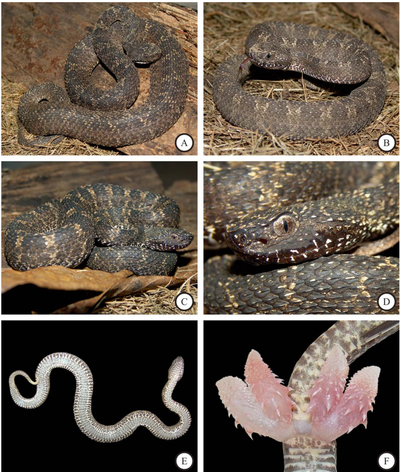
Figure 1. Specimens of Bothrops lutzi found in the present study with their main color patterns and some diagnostics characters. A-C) General view of adult females with snout-vent length of 72.0, 45.2, and 59.0 cm respectively; D) Head detail; E) Ventral color pattern of a juvenile female (SVL = 34 cm); and F) Hemipenis of an adult male SVL = 52.8 cm).