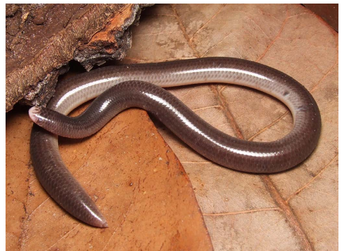
FIGURE 1. Adult Typhlops amoipira from Fazenda Santa Maria da Vereda, municipality of Bonito de Minas, Minas Gerais.

totalizing 34 days of sampling effort. All the records were obtained during the campaigns of Nov-Dec and Feb, when the locality goes through its rainy season. Considering that the region of sampling is characterized by two well marked seasons, these data might suggest that T. amoipira behavior is affected by seasonality being more active during the rainy season, although the small sample does not allow a conclusive statement yet. Specimens (Table 1) are housed in herpetological collection of the Museu de Zoologia João Moojen, Universidade Federal de Viçosa, municipality of Viçosa, state of Minas Gerais (MZUFV).