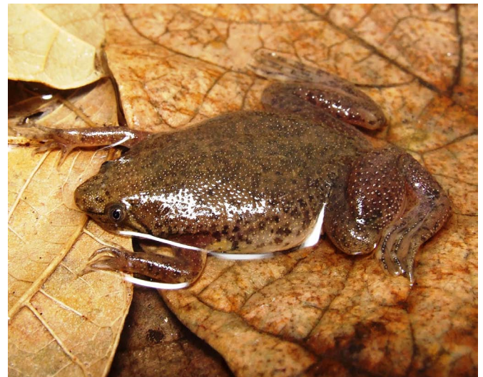
FIGURE 1. Pipa carvalhoi (MZUFV 8671, female, in life) from Sete Cachoeiras, municipality of Ferros, Minas Gerais.

2008). Herein we present data on the distribution of P. carvalhoi in the southeast of Brazil, as also new records in state of Minas Gerais, improving the knowledge about its geographic distribution.