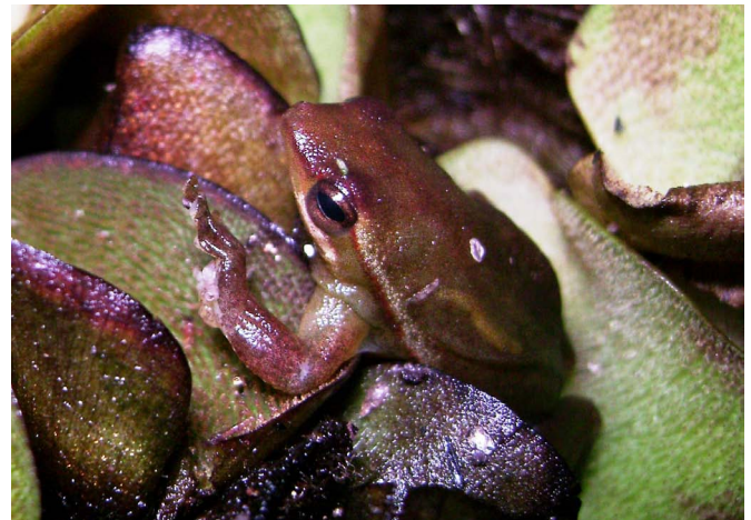
FIGURE 2. Adult male Sphaenorhynchus botocudo (MZUFV 9824 – SVL 28.6 mm ) with emphasis on the presence of the distinctive longitudinal white spot under the eye, a putative autapomorphy of the species.

preservative (Figure 3), which separates S. botocudo from all other congeners, consisting in a putative autapomorphy of the species (Caramaschi et al. 2009).