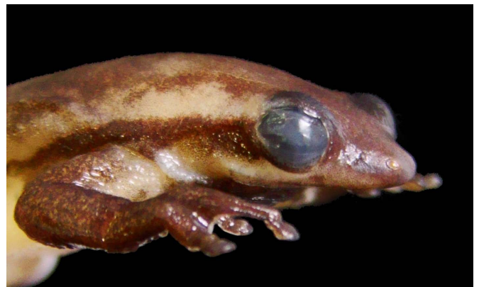
FIGURE 3. Adult male Sphaenorhynchus botocudo in preservative with emphasis on the presence of the distinctive longitudinal white spot under the eye, a putative autapomorphy of the species.