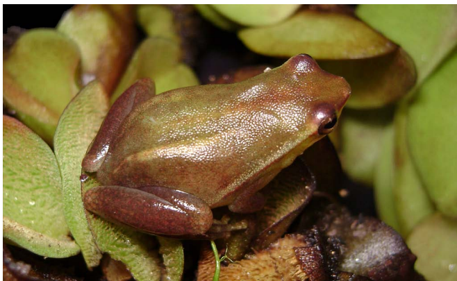
FIGURE 1. Adult male Sphaenorhynchus botocudo from Fazenda Santa Clara, municipality of Mucuri, state of Bahia, Brazil (MZUFV 9824 – SVL 28.6 mm ).