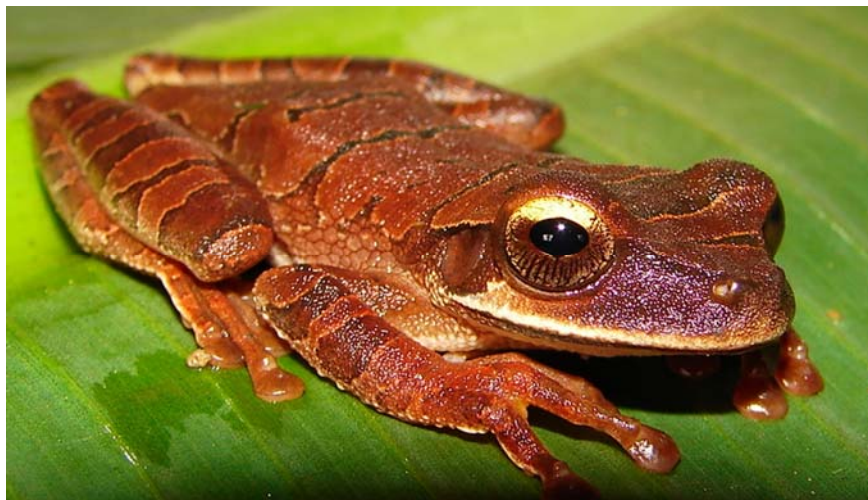
Figure 1. Osteocephalus leoniae (CORBIDI 00306, female, SVL = 53.2 mm) from Tangoshiari, Cusco Region, Perú.

Both localities are situated between the mountain forest and the lower Amazonian basin of Cusco, next to the Machiguenga Communal Reserve. Agricultural lands and fragmented natural areas cover most of the region (Figure 3). Both specimens were collected at night (21:00 h, temperature 27 °C), 200 m uphill from a stream, during the wet season.