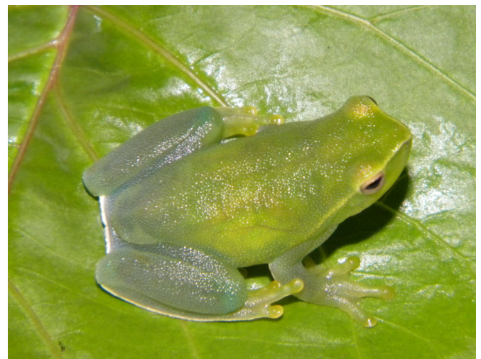
FIGURE 1. Adult male of Sphaenorhynchus lacteus (ZUF RJ 12288) (SVL 29 mm) from municipality of Barras, Piauí state, Brazil.

The municipality of Barras is characterized by having an area with fragmented and irregularly distributed environments. The vegetation is characterized by transitional vegetation composed of "Scrubs" from