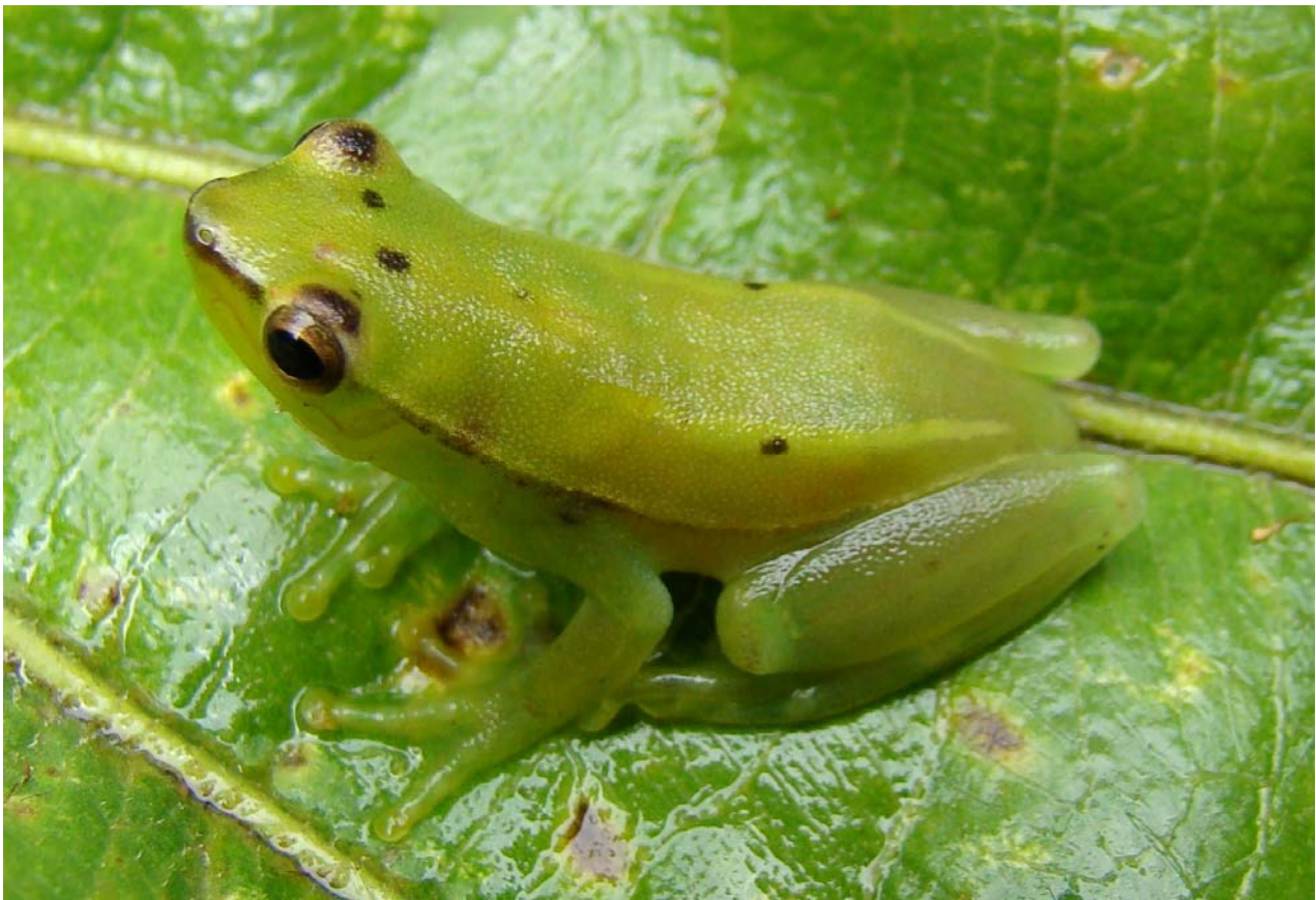
Figure 1. Sphaenorhynchus caramaschii photographed in Avaré, state of São Paulo, Brazil.

et al. 2007). In northeastern state of São Paulo, besides the type locality, S. caramaschii has been recorded to the municipalities of Pilar do Sul, Iporanga, Apiaí and Ribeirão Grande, all localities situated in the type locality neighboring area (Toledo et al. 2007; Bertoluci and Rodrigues 2002; Pombal Jr and Haddad 2005).