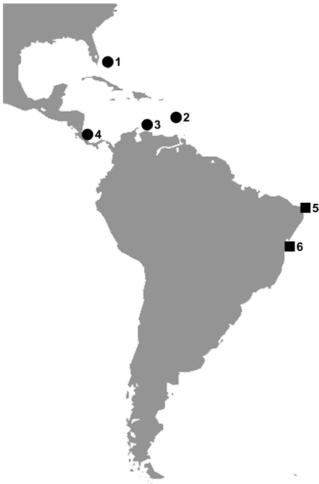
FIGURE 1. Geographic distribution of Flabellina dana . Previous records (circles): 1. Bahamas; 2. St. Lucia (type locality); 3. Curaçao and 4. Costa Rica (Valdés et al. 2006). New records (squares): 5. Rio Grande do Norte and 6. Bahia, Brazilian northeastern coast.

Among the Flabellinidae the species that most resembles F. dana is F. dushia . Some common characteristics are the opaque white color on the head, oral tentacles and most of the dorsum; the foot bilabiate and notched with long propodial tentacles; the pleuroproctic anus, posterior to inter-hepatic space; and the renal and genital opening location. However, the two species can be easily morphologically differentiated due to characteristics in the head, mouth and rhinophores. Flabellina dushia presents rounded head, terminal and triangular mouth and smooth rhinophores, while F. dana has oval head, vertical and sub-terminal mouth and annulate rhinophores (Millen and Hamann 2006; Valdés et al. 2006). The rhinophore is an important diagnostic characteristic of F. dana . It is the only known western Atlantic Flabellinidae with annulate rhinophores (Figure 2C) (Millen and Hamann, 2006).