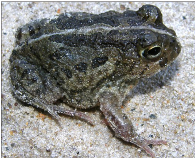
FIGURE 1. Odontophrynus maisuma (CHUFSC 1073) from Praia do Arroio Corrente, municipality of Jaguaruna, Santa Catarina.

Odontophrynus maisuma Rosset, 2008 (Figure 1) was recently described from coastal areas of Uruguay and the Brazilian states of Rio Grande do Sul and Santa Catarina. It is a diploid species belonging to the O. americanus group, and distinguished by its small size and the presence of distinct postorbital and parotoid glands that form a longitudinal ridge. The only records known for Santa Catarina state are those of the original description, based on an adult female (MNRJ 31356) from (Balneário) Gaivotas, in the southern extreme of this state, and for the restinga of Baixada do Maciambu, municipality of Palhoça (Wachlevski and Rocha 2010). Based on specimens collected between 2006 and 2008, vouchered at the herpetological collection of Departamento de Ecologia e Zoologia, Universidade Federal de Santa Catarina (CHUFSC), we present records for two additional localities: one specimen (CHUFSC 1073) from the urban area of Praia do Arroio Corrente, municipality of Jaguaruna (28°41' S, 49°00' W), collected during the day after heavy rain, by I. R. Ghizoni-Jr on 15 January 2006;