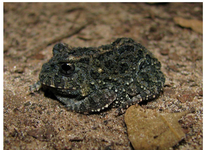
FIGURE 1. Individual of Proceratophrys moratoi collected in the Jardim Botânico Municipal de Bauru, Bauru, state of São Paulo, Brazil.

Fieldworks were carried out between November 2008 and January 2009 at Jardim Botânico Municipal de Bauru (22°20'48.46" S, 49°0'56" W; 550 m). This place occupies 321.71 ha and is predominantly composed of