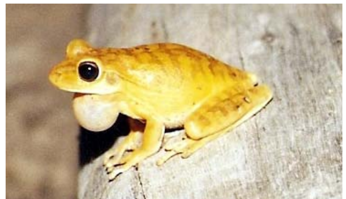
FIGURE 1. A male Hypsiboas raniceps calling in the margin of an artificial lake in Pariqueira-Açu, state of São Paulo, southeastern Brazil.

Although this new record for H. raniceps does not greatly extend its geographic distribution, the major contribution of our data is the record of the species in Atlantic forest areas in the state of São Paulo. There are three possible explanations for the new record of H. raniceps in the Atlantic forest: 1) the region may represent one of the extremes of the species' distribution range, where it was never registered before; or 2) during the Pleistocene glaciation the species may have occupied areas that currently