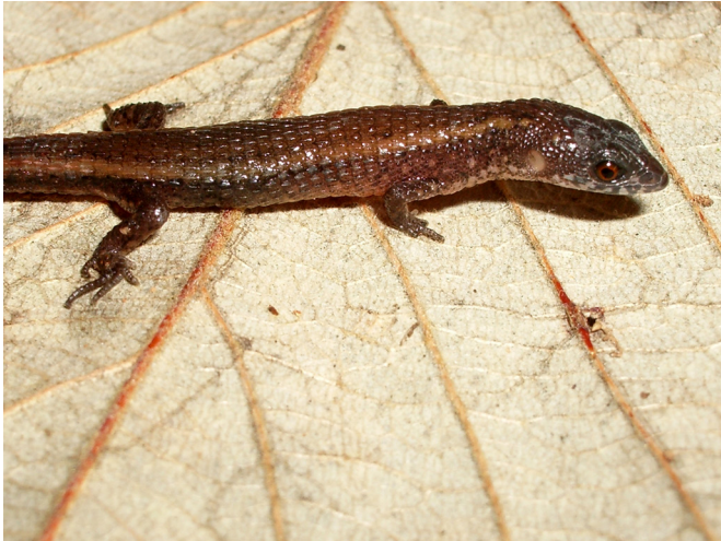
FIGURE 2. An adult Leposoma osvaldoi (UFMT-R 5107) collected in Aripuanã municipality.

(Parque Estadual Igarapés do Juruena – 08°54' S, 59°06' W) UFMT-R 6491, UFMT-R 6737, UFMT-R 7261, UFMT-R 7266-7267, UFMT-R 7422, UFMT-R 7426; 3 – Aripuanã (Serra do Expedito – 10°03' S, 59°29' W) UFMT-R 7186-7188, UFMT-R 7198 and Aripuanã (PCH Faxinal II, Aripuanã city – 10°12' S, 59°27' W) UFMT-R 0983-0984, UFMT-R 1733, UFMT-R 1740-1741, UFMT-R 4194, UFMT-R 4202, UFMT-R 4208-4209, UFMT-R 4285-4586, UFMT-R 5107, UFMT-R 5119-5120, UFMT-R 6439; 5 – Cotriguaçu (Fazenda São Nicolau – 09°48' S, 58°16' W) UFMT-R 8375, UFMT-R 8378, UFMT-R 8388; 6 – Juara (PCH São João da Barra, Distrito de Paranorte – 10°25' S, 57°38' W) UFMT-R 5992; 7 – Paranaíta (UHE Apiacás – 09°22' S, 57°03' W) UFMT-R 7235, UFMT-R 7243.