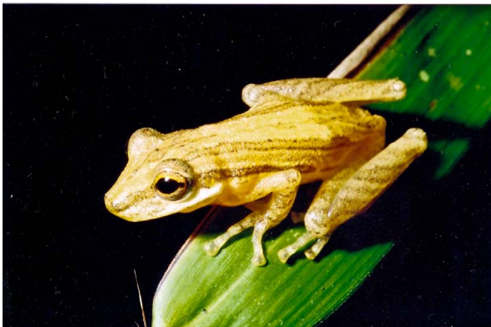
Figure 1. A male individual of Scinax cardosoi from Reserva Particular do Patrimônio Natural Ovídio Antônio Pires, municipalities of Santa Rita da Jacutinga and Bom Jardim de Minas, state of Minas Gerais.

Scinax cardosoi was described from Vale da Revolta , municipality of Teresópolis, state of Rio de Janeiro, Brazil. According to Frost (2009), this species occurs only on the vicinity of the type locality in the state of Rio de Janeiro, Brazil. However, at the description of this species, the type material also included specimens from the municipality of Domingos Martins at the state of Espírito Santo (Carvalho-e-Silva and Peixoto 1991). In the present paper we report new records for Scinax cardosoi at the state of Minas Gerais, Brazil.