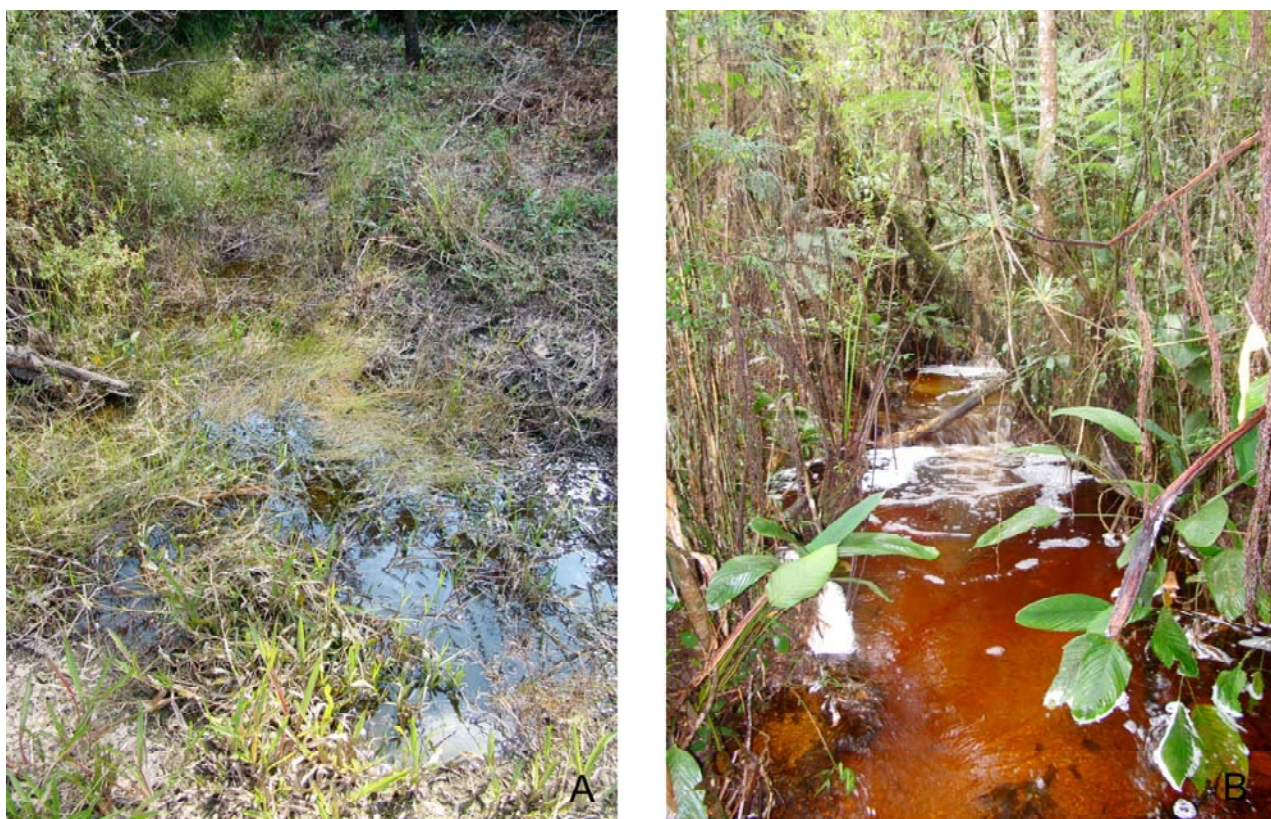
Figure 3. Open (A) and forest (B) area where individuals of Scinax cardosoi were observed at Reserva Particular do Patrimônio Natural Ovídio Antônio Pires , municipalities of Santa Rita da Jacutinga and Bom Jardim de Minas, state of Minas Gerais.