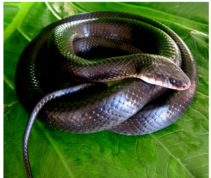
FIGURE 1. Boiruna sertaneja from Serra da Mão, Municipality of Traipu (MUFAL 9171, male, SVL 159 mm).

This new location corroborates earlier observations made by Zaher (1996), who suggested that the habitat of this species consists of xeric formations in the lowlands of northeast Brazil.