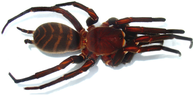
FIGURE 2. Dorsal view of Trechona venosa Latreille, 1832, adult female (MNRJ 00100), from Mata do Paraíso, municipality of Viçosa, state of Minas Gerais, Brazil.