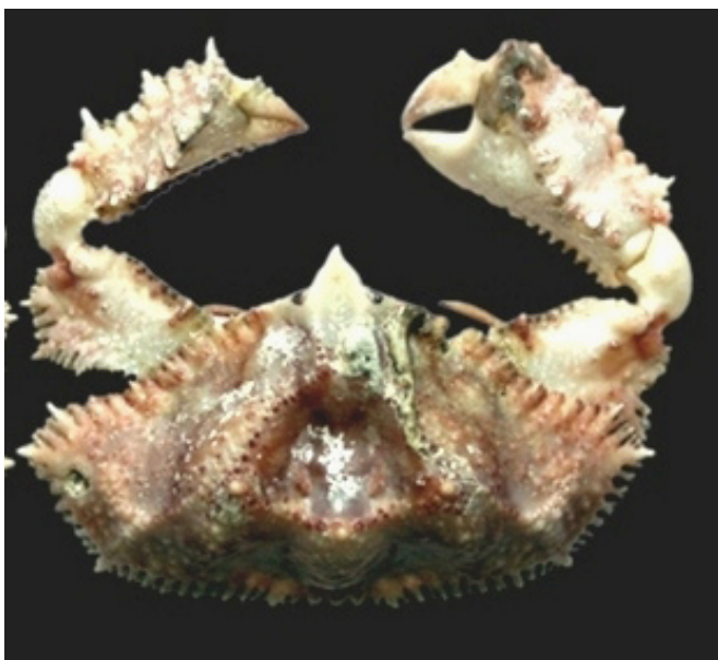
FIGURE 2. Cryptopodia angulata Dorsal view (ZL-AR-CR-35).

The present record of Cryptopodia angulata is the first report from Saurashtra coast, Gujarat, India. The brachyuran fauna of this particular area is not studied well and present study is part of the exploration.