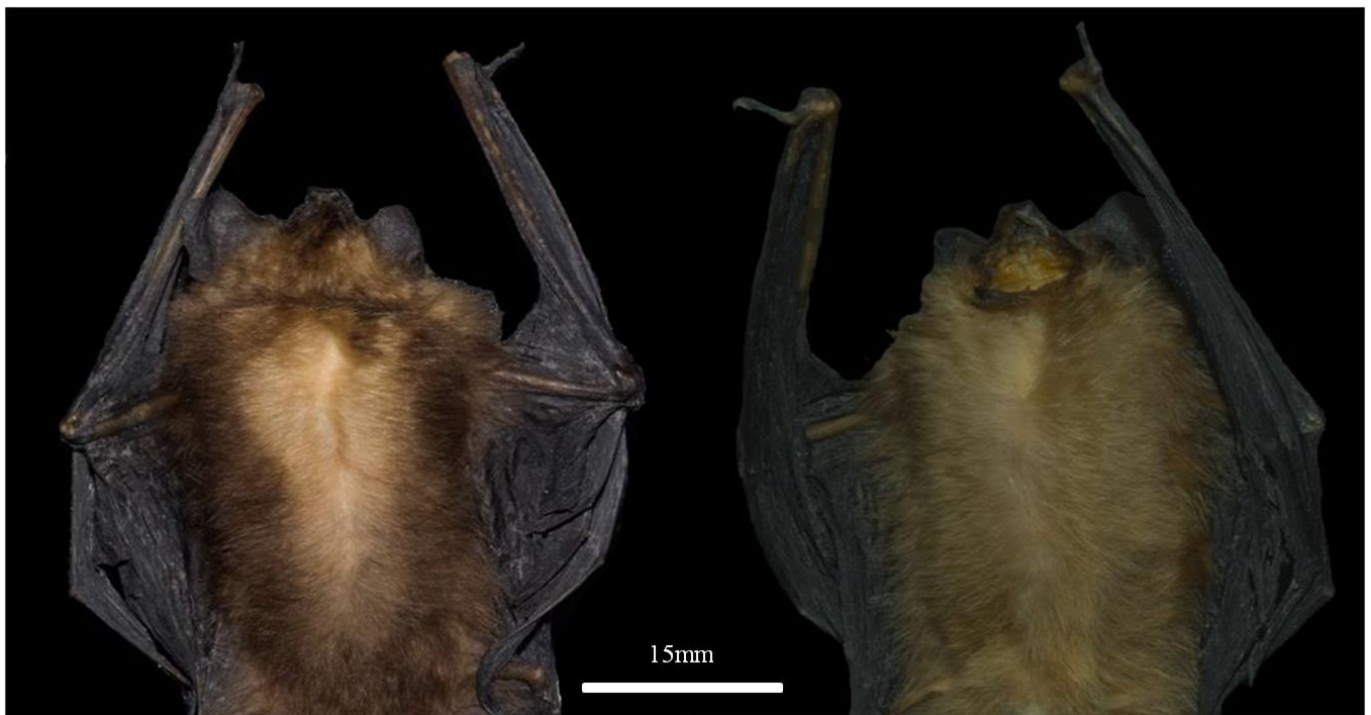
FIGURE 2. Dorsal and ventral views of the specimen of Rhogeessa hussoni (ALP 9656) from Refúgio da Vida Silvestre Mata do Junco, Sergipe, northeastern Brazil.